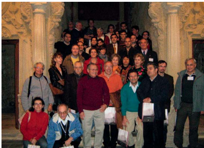
Visit to Baeza, 2007 Palacio Jabalquinto