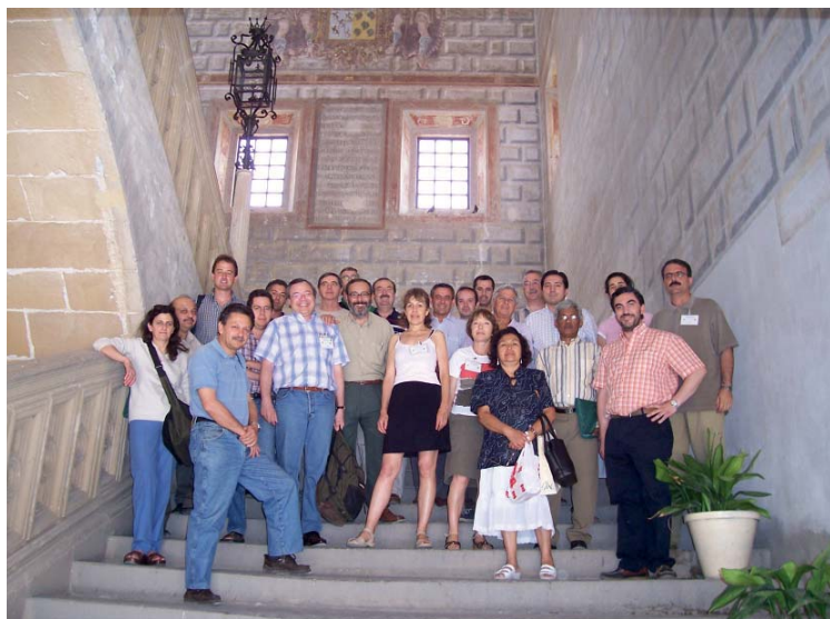
Group Picture, 2005 Hospital de Santiago, Úbeda