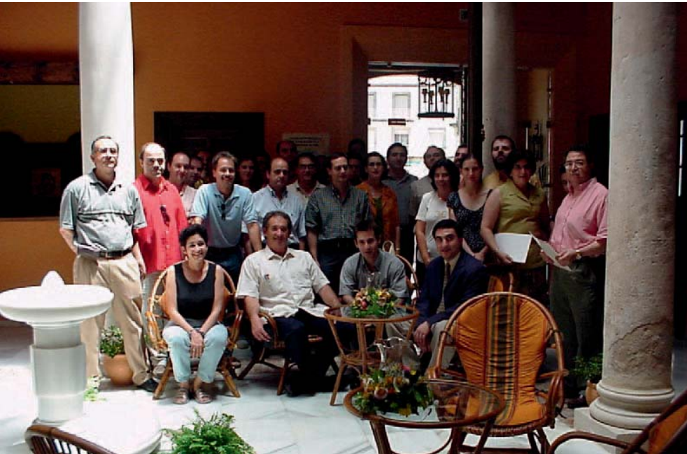
Group Picture, 2000 Hotel de María, Úbeda