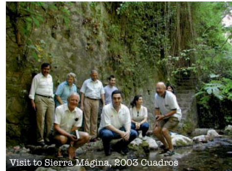
Visit to Sierra Mágina, 2003 Cuadros