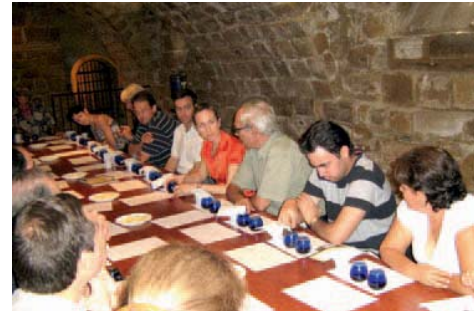
Olive oil tasting, 2008 Úbeda