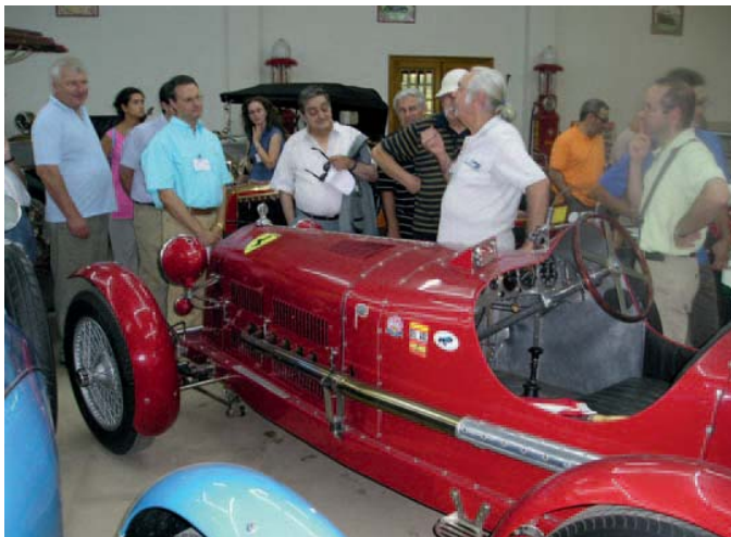
Visit to Andújar, 2006 Museo del Val