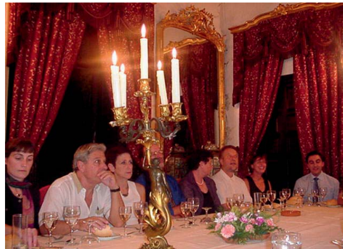
Gala Dinner, 2001 Palacio Marqués de la Rambla, Úbeda