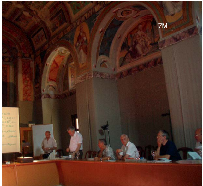
Lectures room, 2003 Hospital de Santiago, Úbeda